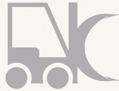
PAPER ROLL SPECIAL