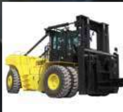
Issue(s) detected by RemoteTech