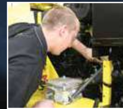
Issue(s) addressed by service tech