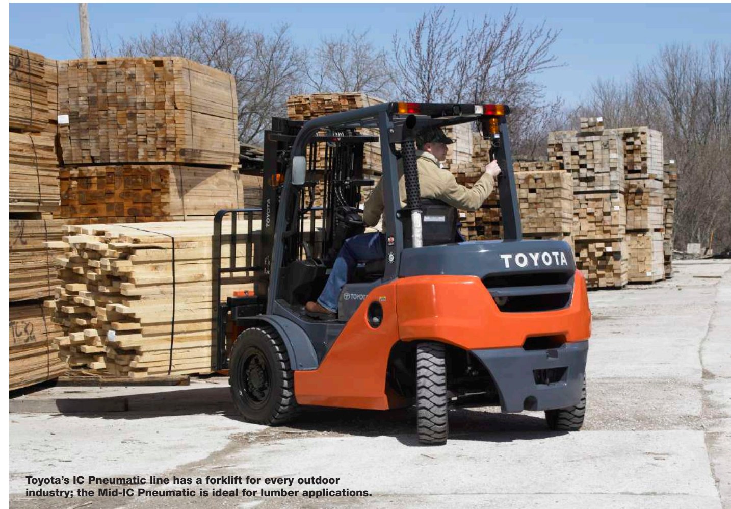
Toyota's IC Pneumatic line has a forklift for every outdoor industry; the Mid-IC Pneumatic is ideal for lumber applications.

THE LUMBER INDUSTRY: Take a trip to your local Home Depot and in the store's lumber section you'll see an expansive variety of wood grouped in wide bundles, each of which weighs about 2,000 pounds to 3,000 pounds. Maneuvering these products around the