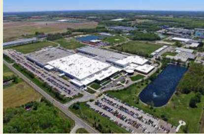
Toyota's manufacturing and business campus in Columbus, IN is home to Toyota Industrial Equipment Manufacturing's state of the art manufacturing floor, a key attraction for visitors.

The plant's high visitor volume places it at the top of the list of the "most visited manufacturing plants in the world," and prompts at least some of those visitors to go back to their own operations and try to emulate Toyota's success.