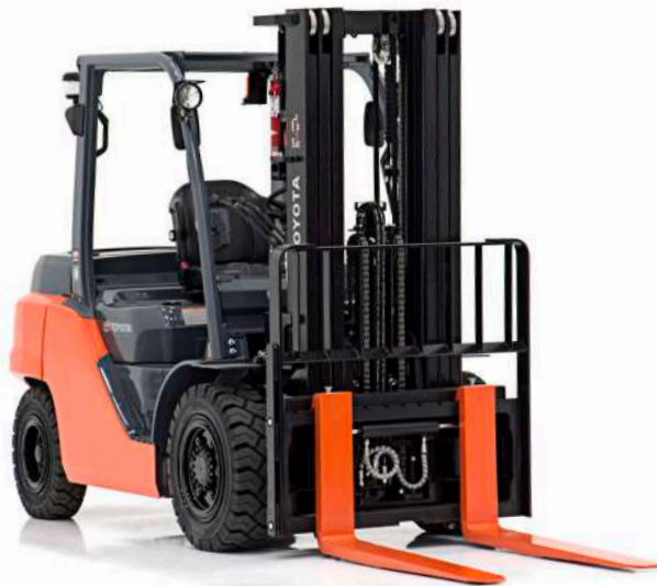
The Toyota Core IC Pneumatic Forklift is an industry leader in utility and reliability for outdoor use and is manufactured in the American heartland in Columbus, IN.

THE MAINSTAY OF MANY different industrial manufacturing operations, internal combustion (IC) forklifts are in a class of their own when it comes to heavy lifting in any tough environment. Used frequently by manufacturers, shippers, construction firms, ports, and other organizations, IC pneumatic forklifts can handle pallets, shipping containers, and even large pipeline sections.