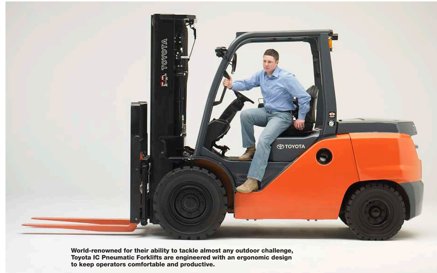
World-renowned for their ability to tackle almost any outdoor challenge, Toyota IC Pneumatic Forklifts are engineered with an ergonomic design to keep operators comfortable and productive.

Classified by the Industrial Truck Association (ITA), forklifts are categorized into five different types (Class 1-5), with Class 5 vehicles comprising IC forklifts with pneumatic tires. Powered by liquid propane gas (LPG), compressed natural gas