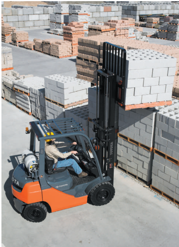
Toyota IC Pneumatic Forklifts offer a wide range of lift capacities, providing solutions for many material handling needs.

D esigned and manufactured from the ground up with operator safety, comfort, productivity, and efficiency in mind, Toyota offers a line of material handling equipment that includes hand pallet jacks to electric forklifts, IC forklifts, reach trucks, order pickers, and electric hand pallet jacks and stackers, among others.