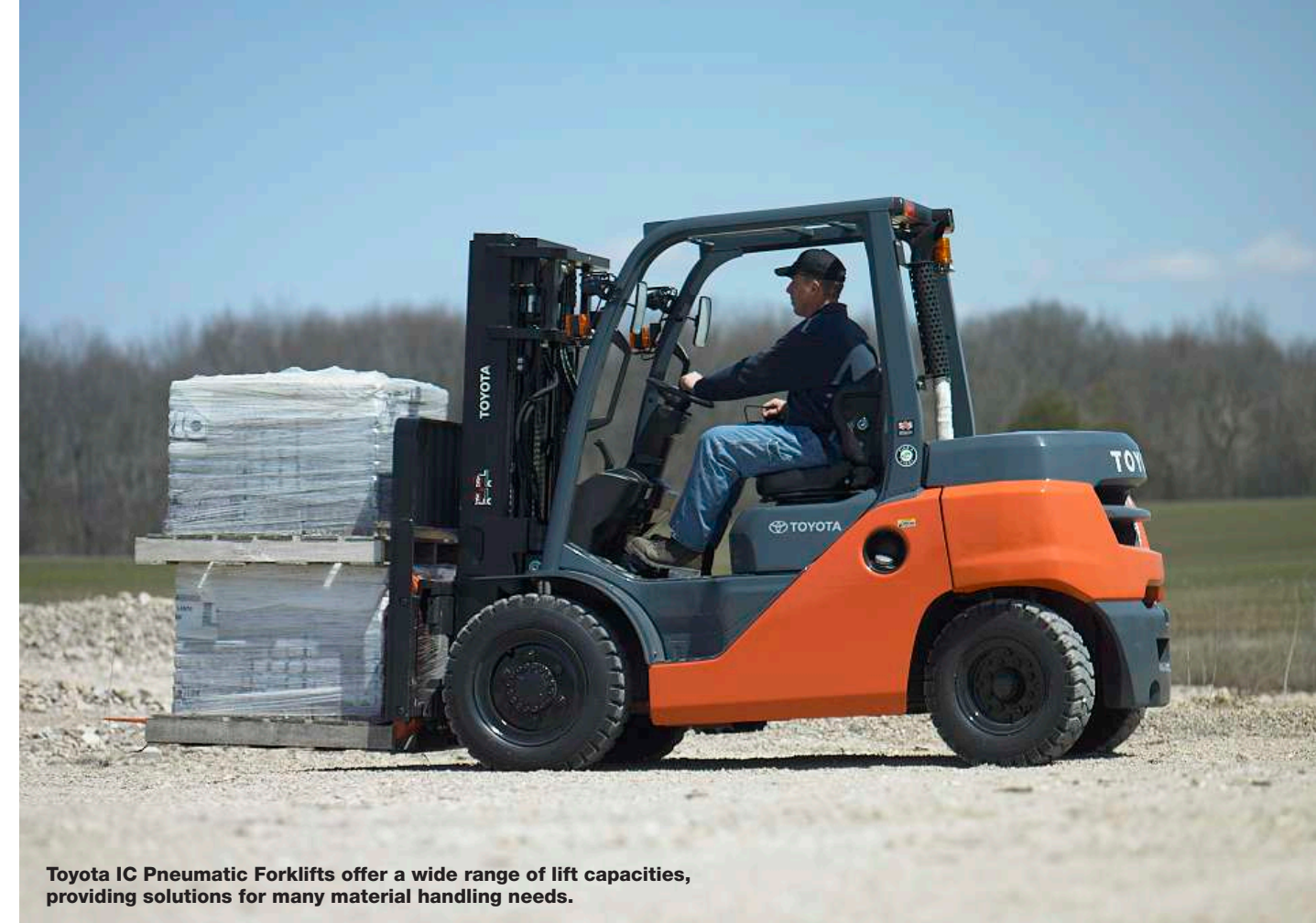
Toyota IC Pneumatic Forklifts offer a wide range of lift capacities, providing solutions for many material handling needs.

The manufacturer makes an empty container handler, a loaded container handler, a reach stacker, and a 125,000-pound capacity model that's excellent for port use. "Our reach stacker can stack containers five-high and three-deep," Byrd says, "and we also offer a roll-on/roll-off model that can actually be driven