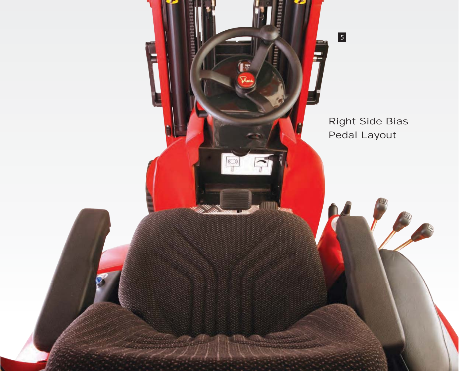
Right Side Bias Pedal Layout