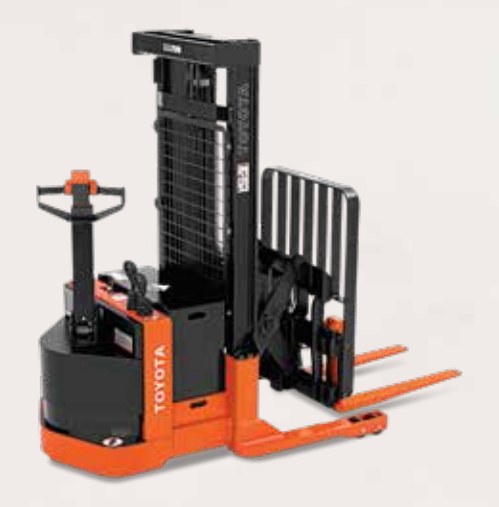
WALKIE REACH TRUCK