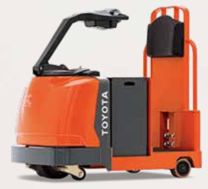
CORE TOW TRACTOR