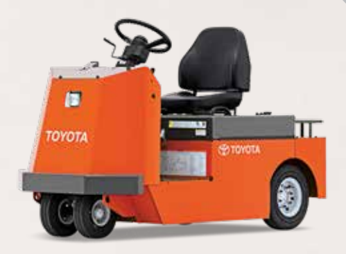
MID TOW TRACTOR