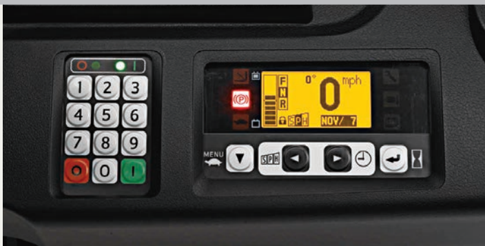
LCD Multifunction Display (STD) & Pin Code Entry System (OPT)