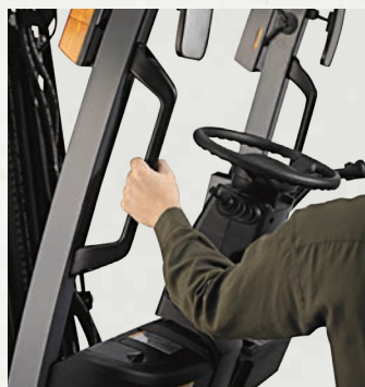
Dual Operator Assist Grips