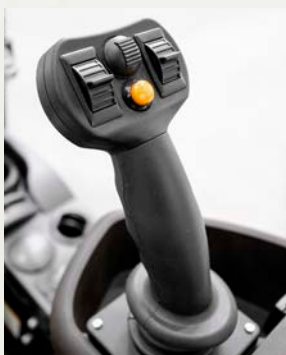
EZ Control Joystick (OPT)