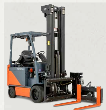
Core Electric Turret Attachment Available