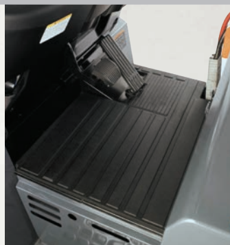
Heavy-duty Non-slip Floor Mat