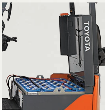
Heavy-Gauge, Formed-Steel Battery Compartment Hood