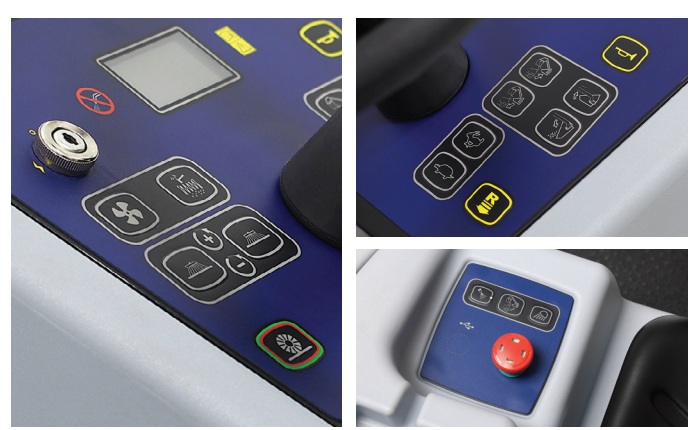
Minimal user training required.