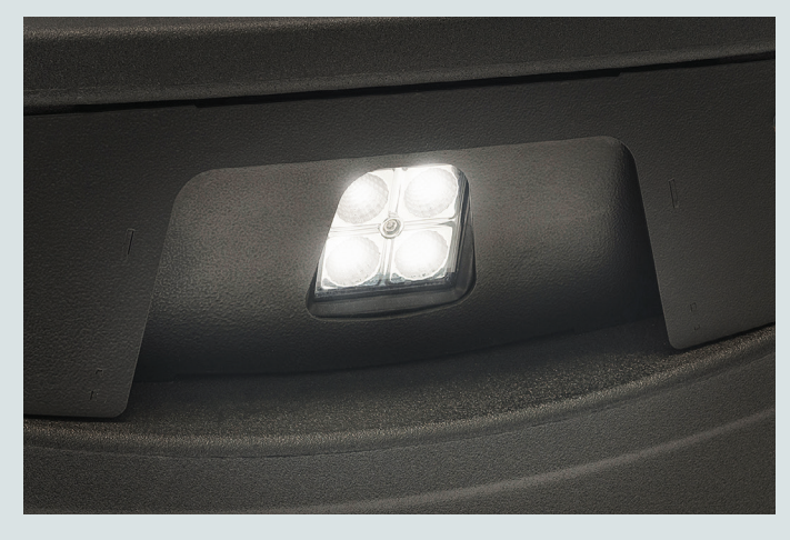
Bright LED headlights provide greater visibility in dimly lit environments.