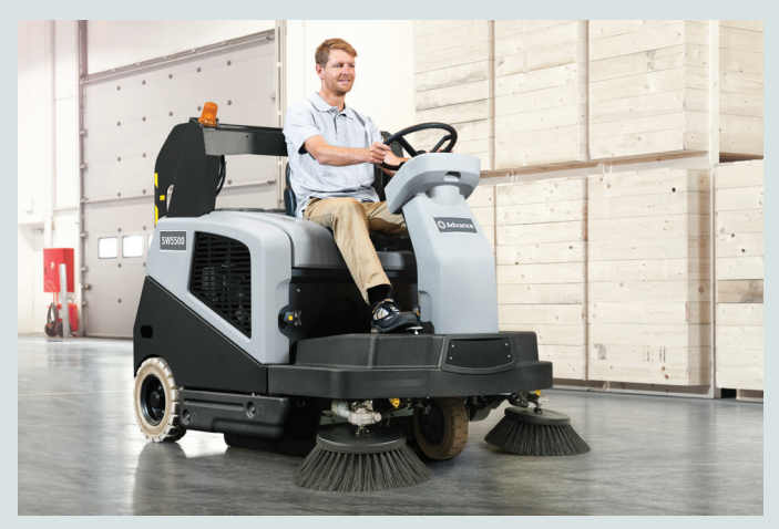
Visibility from the operator's seat offers clear sightlines for greater safety and consistent edge cleaning.