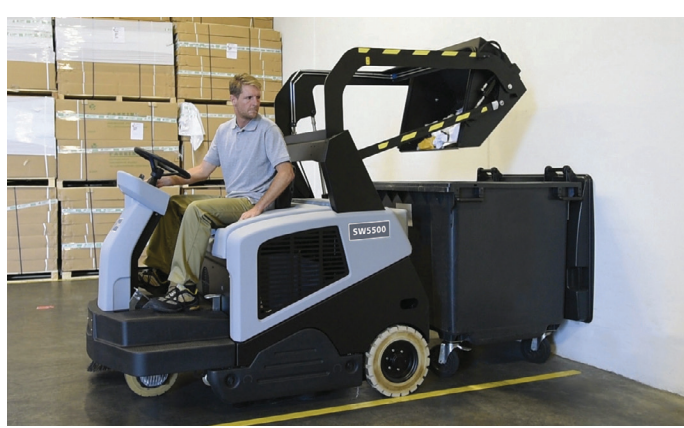
Compact overthrow design with direct throw sweeper performance.