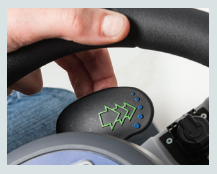
EcoFlex<sup>™</sup> System allows for flexible detergent settings with a chemical free cleaning mode and burst of power for powerful spot cleaning at the touch of a button.