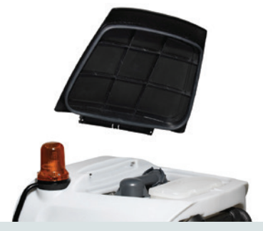
Easy to clean with recovery tank lid completely removable. (Shown with optional safety beacon light.)