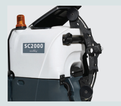
Built-in squeegee hanging system on tank allows for safe transportation through doorways and tight areas, while permitting tank drying.