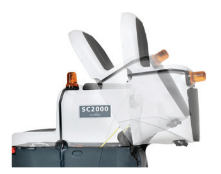
Recovery tank fully tiltable gives easy access to battery compartment and EcoFlex<sup>™</sup> System.