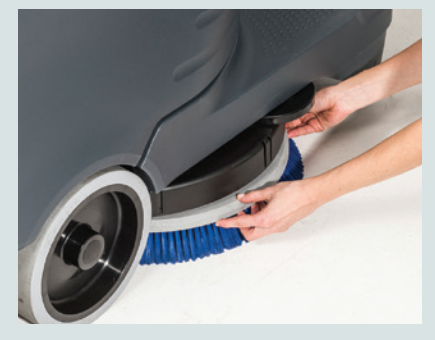
Tools-free removable brushes or pads.