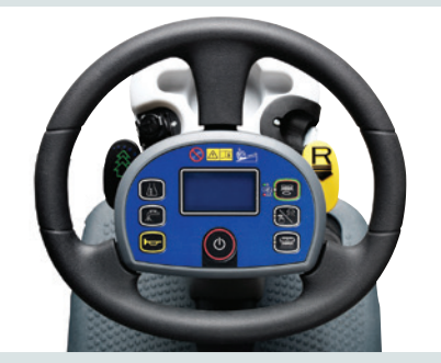
Extremely user friendly and easy to learn. Dashboard with One-Touch button and intuitive display integrated into the steering wheel.

Conventional automatic scrubbers tend to apply more water and cleaning solution on the floor than what is needed, especially when maneuvering around obstacles, slowing down on turns or cleaning along edges. SmartFlow<sup>™</sup> technology eliminates extra solution dispensing by automatically reducing the solution flow rate when the machine is slowed down, extending the productivity per tankful. With larger tanks and less solution dispensed, operators will extend the time between dump and refill cycles by as much as 50%. The use of less solution with SmartFlow helps eliminate waste and more importantly, lessens the risk of slip and fall incidents within the facility.