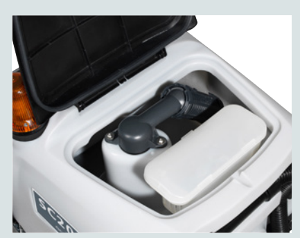
Flip-up lid and tilt-back tank provides easy access to the recovery tank, debris catch cage, batteries and EcoFlex™ cartridge.