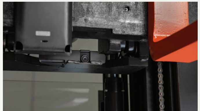
Carriage-mounted camera system