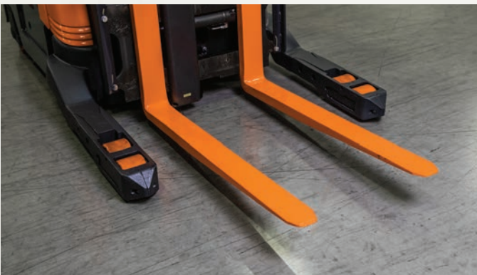
Ductile iron baselegs