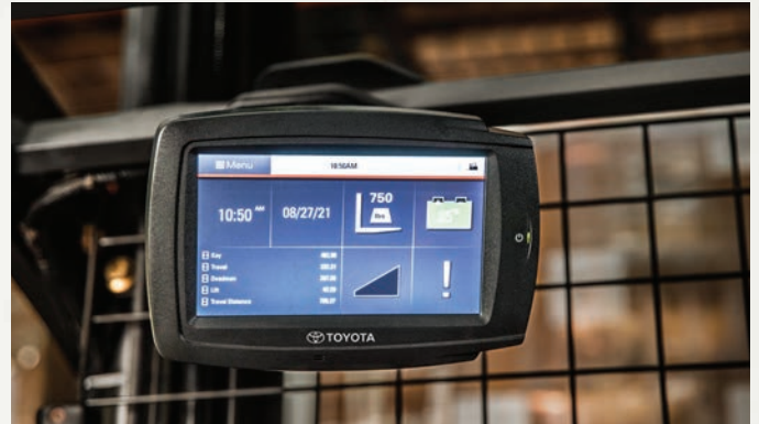
7" Color Touchscreen Display