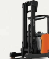
Moving Mast Reach Truck (Indoor Only) 1 3,000-5,500 lbs.