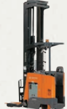
Sidestance Reach Truck 2,500-4,500 lbs.