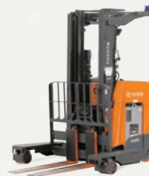
Multidirectional Reach Truck 4,500 lbs.