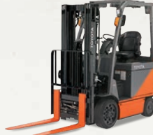
Core Electric 3,000-6,500 lbs.