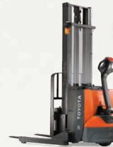
Walkie Stacker 2,000-2,500 lbs.