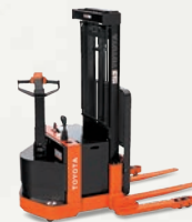
Industrial Walkie Stacker 2,200-4,000 lbs.