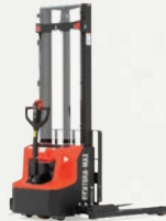
Tora-Max Stacker 2,600 lbs.