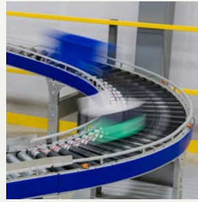
Conveyor Sorting Systems