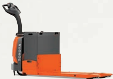
Large Electric Walkie Pallet Jack 6,000-8,000 lbs.