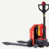
Tora-Max Compact Electric Walkie Pallet Jack 3,300-4,500 lbs.