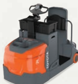
Industrial Tow Tractor 15,000 lbs. on flat surfaces