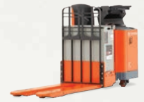
Enclosed End Rider Pallet Jack 6,000-8,000 lbs.