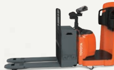
Side-Entry End Rider 6,000-8,000 lbs.