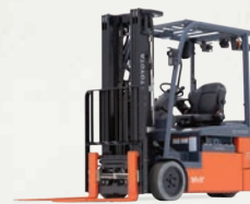
3-Wheel Electric 3,000-4,000 lbs.

Toyota is here to help optimize your business for maximum efficiency. Utilizing Toyota Lean Management principles, Toyota Dealers can provide insights and develop appropriate plans to tackle your specific operational needs. This unique approach to optimization and elimination of waste can provide you with significant competitive advantages and a sustainable lean culture for lasting process improvement.