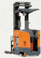
Fore-Aft Reach Truck 2,500-4,500 lbs.