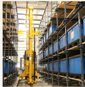
Automated Storage and Retrieval Systems