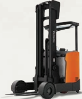
Moving Mast Reach Truck (Indoor/Outdoor) 1 3,500 lbs.