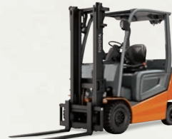
80V Electric Pneumatic 4,000-7,000 lbs.