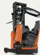
Tilting Moving Mast Reach Truck (Indoor Only) 1 3,000-5,500 lbs.