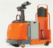
Core Tow Tractor 10,000 lbs.