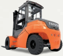
80V Electric Pneumatic 13,000-17,500 lbs.