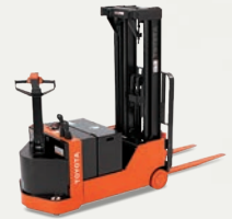
Counter-Balanced Stacker 2,000-4,000 lbs.