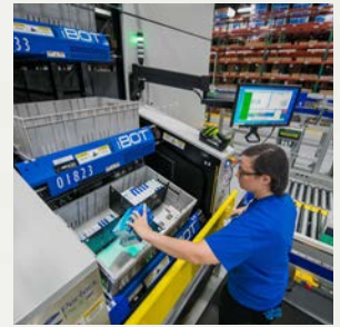
Goods-to-Person Picking and Automated Order Fulfillment