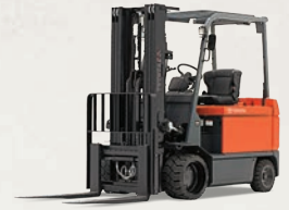
Large Electric 8,000-12,000 lbs.