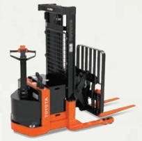
Walkie Reach Truck 3,000 lbs.