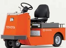
Mid Tow Tractor 8,800-13,200 lbs.