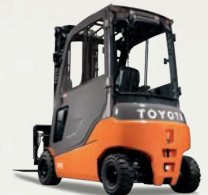
48V Electric Pneumatic 3,000-4,000 lbs.