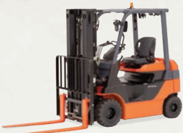
48V-80V Electric Pneumatic 3,000-7,000 lbs.