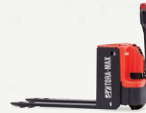
Tora-Max Electric Walkie Pallet Jack 4,000 lbs.