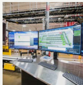
Industrial Control Systems