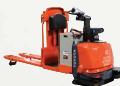
Center-Controlled Rider Automated Forklift 6,000-7,000 lbs.