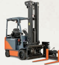
Core Electric Turret Forklift 2,500 lbs.