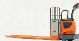
End-Controlled Rider Pallet Jack 6,000-8,000 lbs.