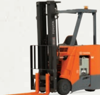
Stand-Up Rider 3,000-5,000 lbs.