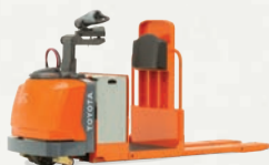
Center-Controlled Rider Pallet Jack 6,000-8,000 lbs.