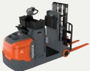
Center Rider Stacker 2,500 lbs.