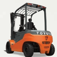
80V Electric Pneumatic 8,000-11,000 lbs.