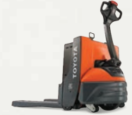
Electric Walkie Pallet Jack 4,500 lbs.