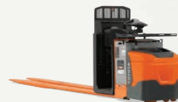
Low Level Order Picker 6,000-8,000 lbs.