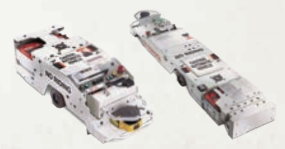
Automated Guided Carts 800-4,000 lbs.