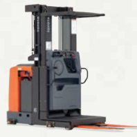
Order Picker 3,000 lbs.