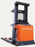
Furniture Order Picker 1,600 lbs.