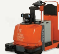
Core Tow Tractor Automated Forklift 10,000 lbs.