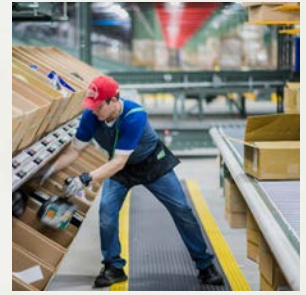
Automated Warehouse Picking Technologies