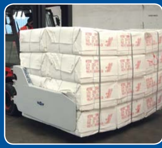
Ports and Logistic