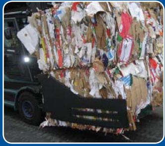
Waste Management Industry