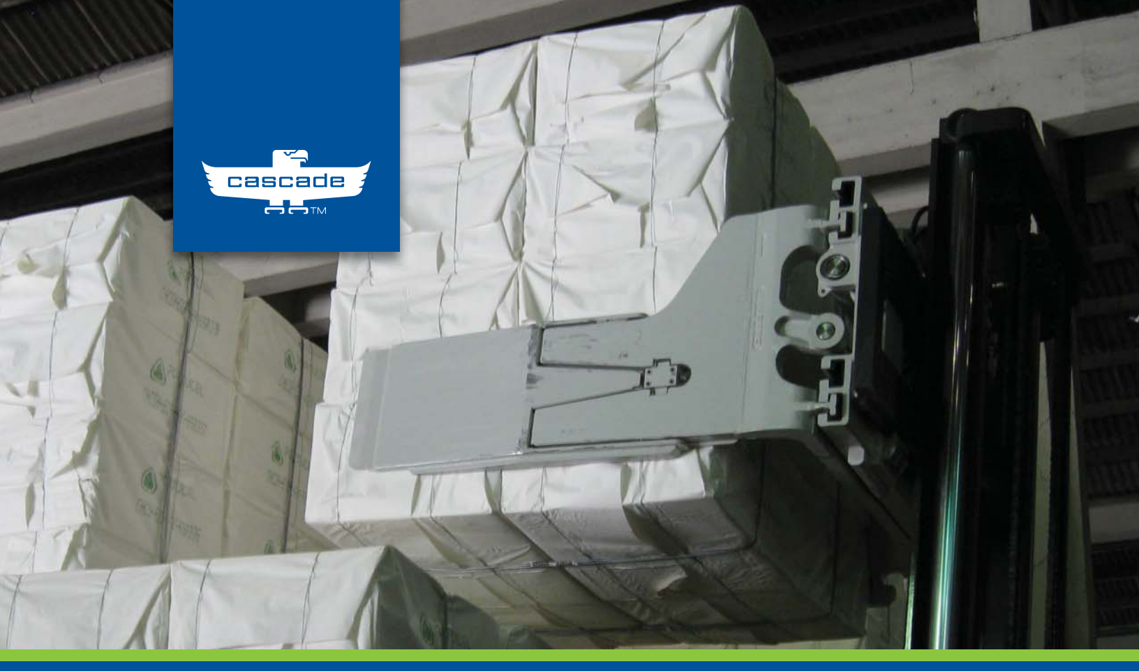
High Capacity G-Series Bale Clamps