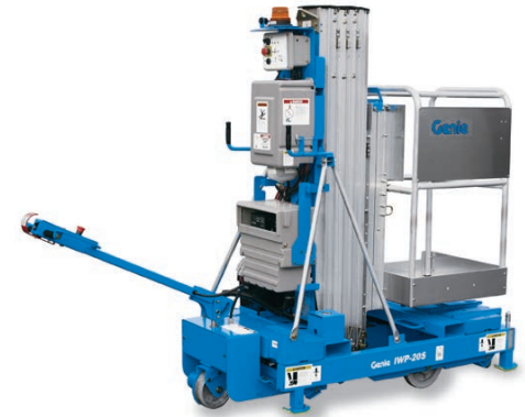
Shown with optional power wheel assist

* Adds 12.5 in (.32 m) to unit length and 285 lbs (129 kg) to unit weight